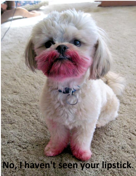
No, I haven't seen your lipstick.