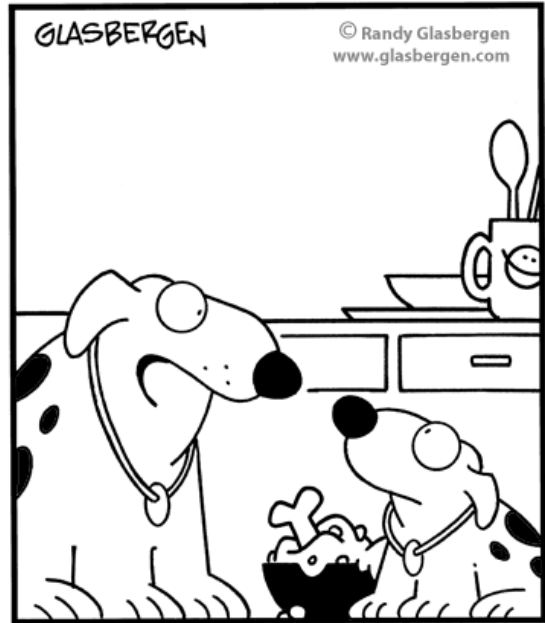
"The 4 basic food groups are stuff in your dish, stuff on the counter, stuff in the trash, and stuff in the laundry."