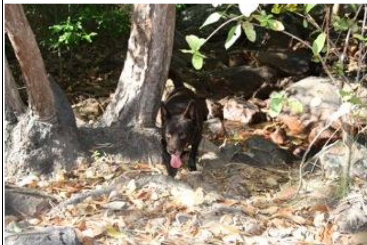
Pondering the next big climb