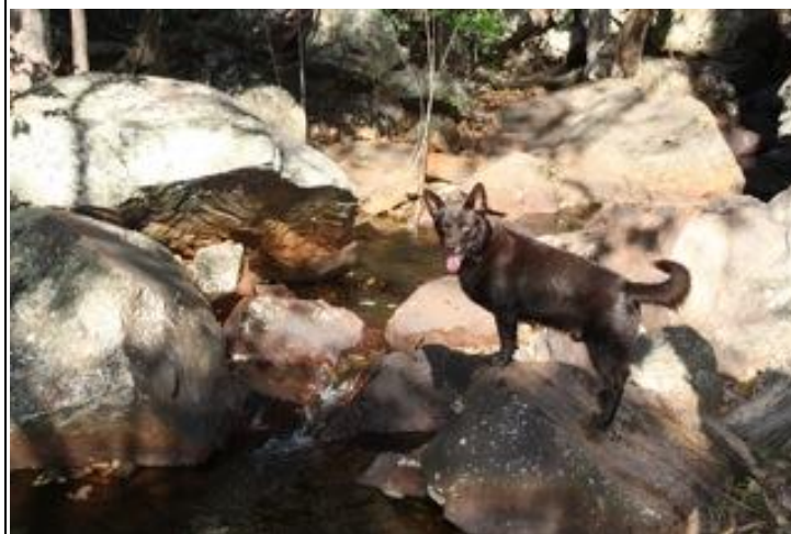
A rewarding swim to cool off.