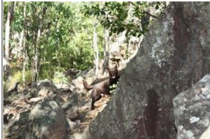
The hike in